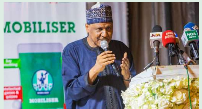
Minister of Information and National Orientation, Alhaji Mohammed Idris, unveiling the app

In clear terms, the Mobiliser stands as a comprehensive platform aimed at empowering the youths to voice their concerns, stay informed through news updates, engage in educational activities, and contribute to societal issues through reporting and participation.